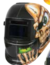
American Eagle NG 4654