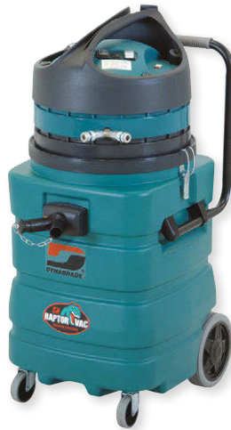
Non-Conductive Polycarbonate Canister 25 Gallon / 94 Liter Capacity