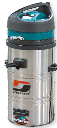
Conductive Stainless Steel Canister 20 Gallon / 75 Liter Capacity